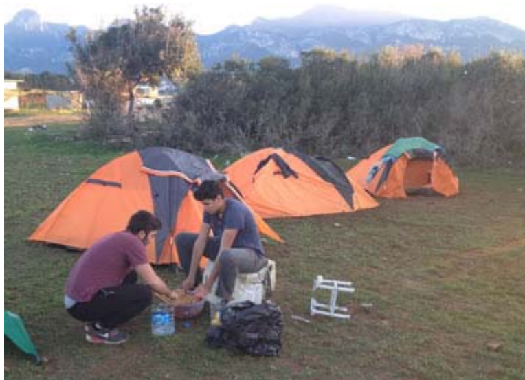
Learning Camping Skills