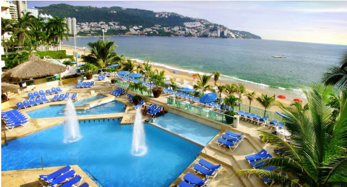
Acapulco Hotel, Kyrenia

We believe that this strong partnership between Final Education Institutions, Turkey's top educational brand, and DMG-Akgünler, the outstanding company in the North Cyprus tourism sector, will also achieve great success in the field of higher education.